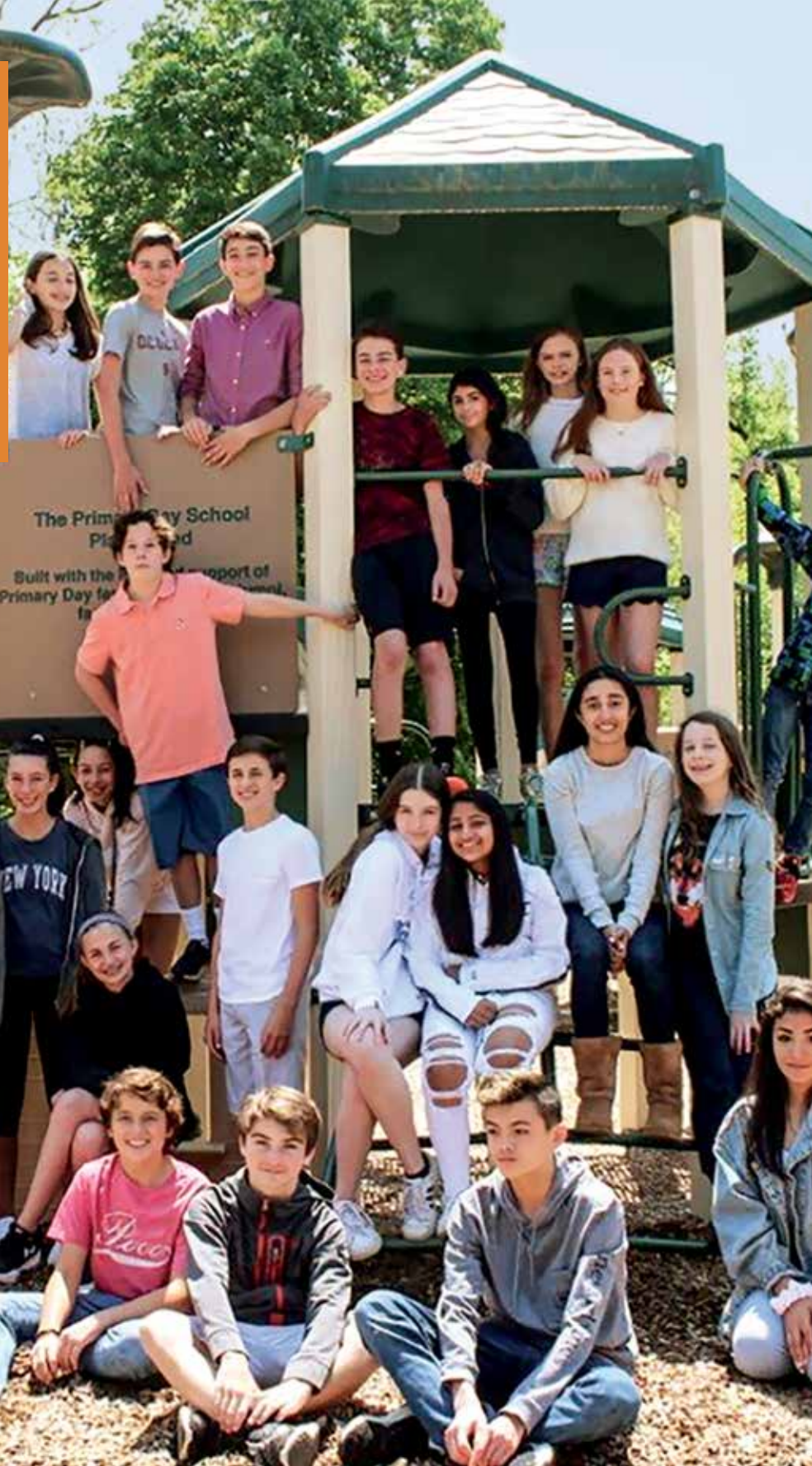
The Class of 2014 gathers at a Primary Day reunion.

Strengthen our sense of connection with and among our current and extended Primary Day family and embrace opportunities to enhance diversity and inclusion and to connect with the broader community.